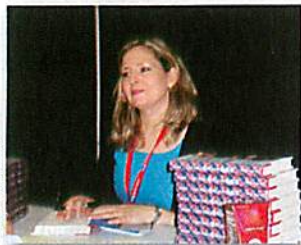
Carter at BEA, signing her latest book.

Ally Carter's Gallagher Girls series, starring teenage spy-in-training Cammie Morgan, has been steadily gaining fans; book three, Don't Judge a Girl by Her Cover , went on sale June 9 with a 250,000-copy first printing. While there isn't any news yet from Walden Media, which optioned her first book back in 2007, Carter recently told Children's Bookshelf she has finished a draft of a fourth Gallagher Girls title. And her first standalone novel, Heist Society , comes out from Disney-Hyperion next February. "It's very fast-paced and takes place in lots of fun, exciting settings," Carter said. "If George Clooney and Julia Roberts from Ocean's Eleven had a 15-year-old daughter, this could be her story."